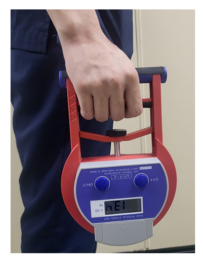
Fig. 2. A handgrip strength test using a handgrip dynamometer. Low muscle strength is defined as a handgrip strength of <28 kg for men and <18 kg for women.

Gait or walking speed is widely used for assessing the functional performance of sarcopenia. A slow gait speed has been associated with an increased risk of sarcopenia, disability, and adverse health outcomes. A commonly used walking speed test is called the 6-meter usual walking speed test, which uses a stopwatch or electronic